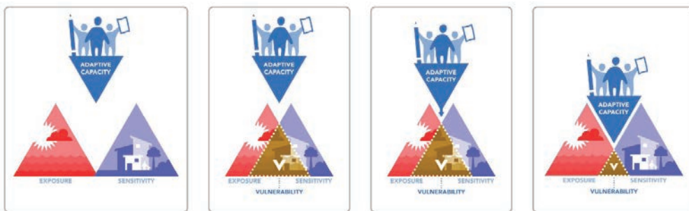
Fig. 1. The Vulnerability Framework - (UN-Habitat, 2014)

Exposure: The nature and degree to which a system (People, property, or other elements present in hazard zones) is exposed to Disaster or significant climatic variations and subject to potential losses today and in the future for the city/region.