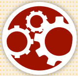
Working under pressure