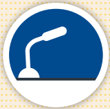
Diction & Oratory