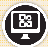
Computing & Office package