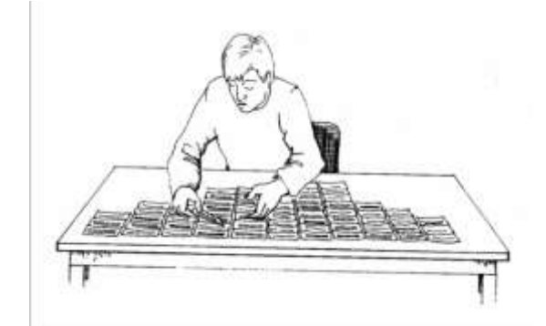
Figure 3 : Completing the Q-sort

This distribution includes 11 columns for 54 statements. The Q-set statements were typed in bold, black letters with a 16-pt font size and cut out to 12 cm.