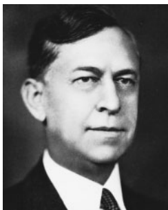
Leonard Eugene Dickson (1874–1954)

Historical Note The use of the term adjoint for the transpose of the matrix of cofactors appears to have been introduced by the American mathematician L. E. Dickson in a research paper that he published in 1902.