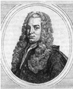
Gabriel Cramer (1704–1752)

Our next theorem uses the formula for the inverse of an invertible matrix to produce a formula, called Cramer's rule , for the solution of a linear system A\mathbf{x} = \mathbf{b} of n equations in n unknowns in the case where the coefficient matrix A is invertible (or, equivalently, when \det(A) \neq 0 ).