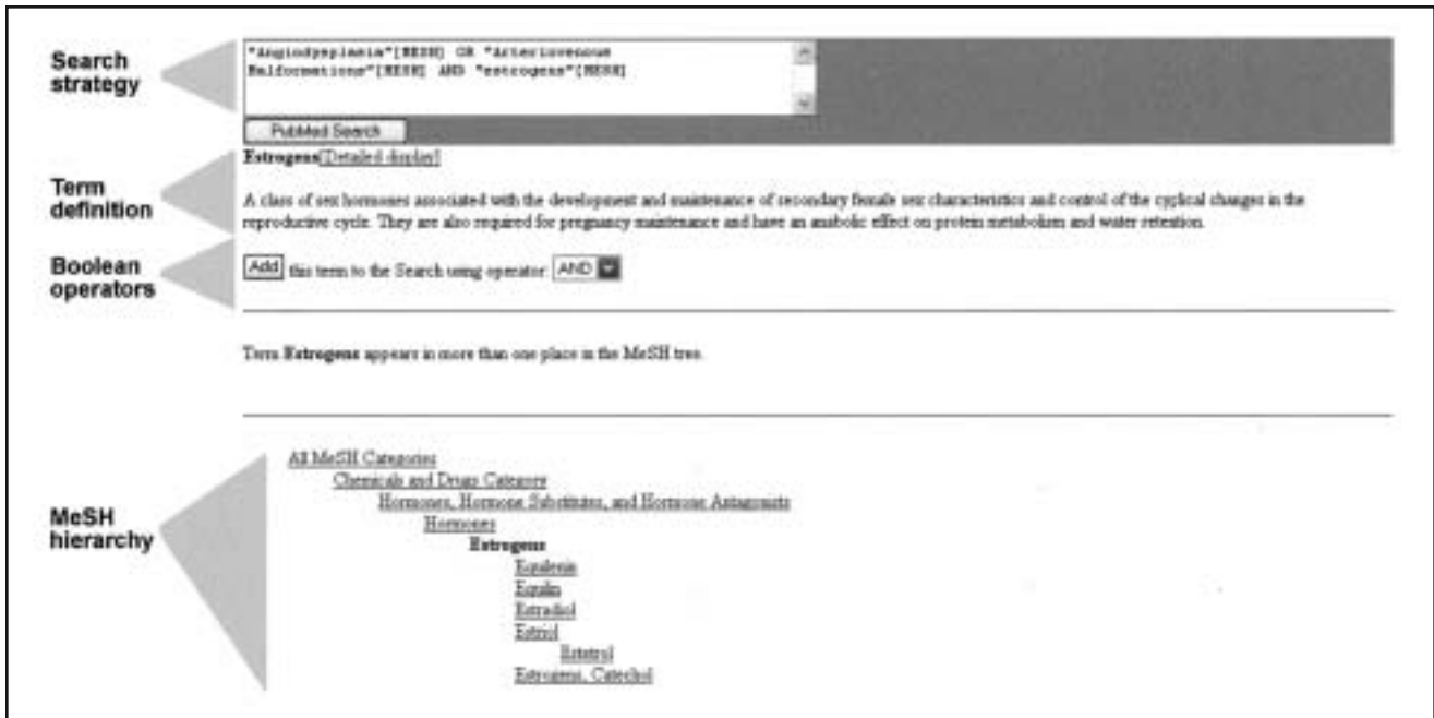
Figure 3. Constructing search strategies with MeSH ( Medical Subject Heading ) terms.