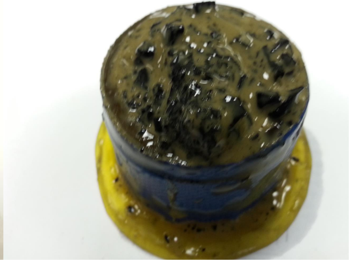
Using Crushed Waste Car Tyres

Samples at the end of Fracture Seal Experiments (Wellbore Strengthening)