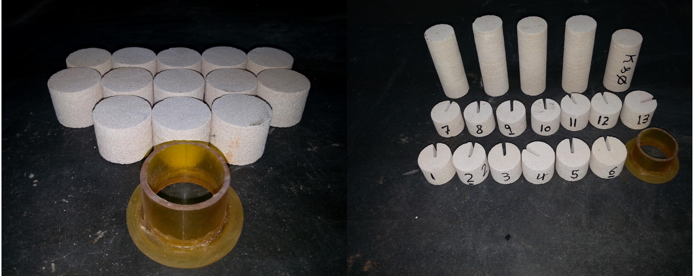
Preparation of the Man-made Fractured Cores