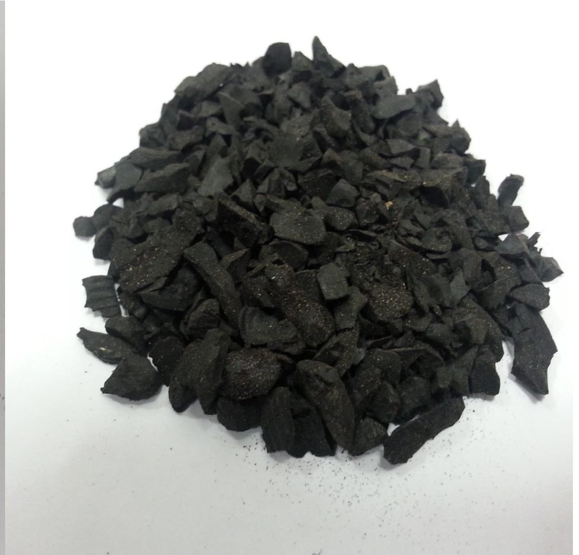
Waste Car Tyres before and after Crusing