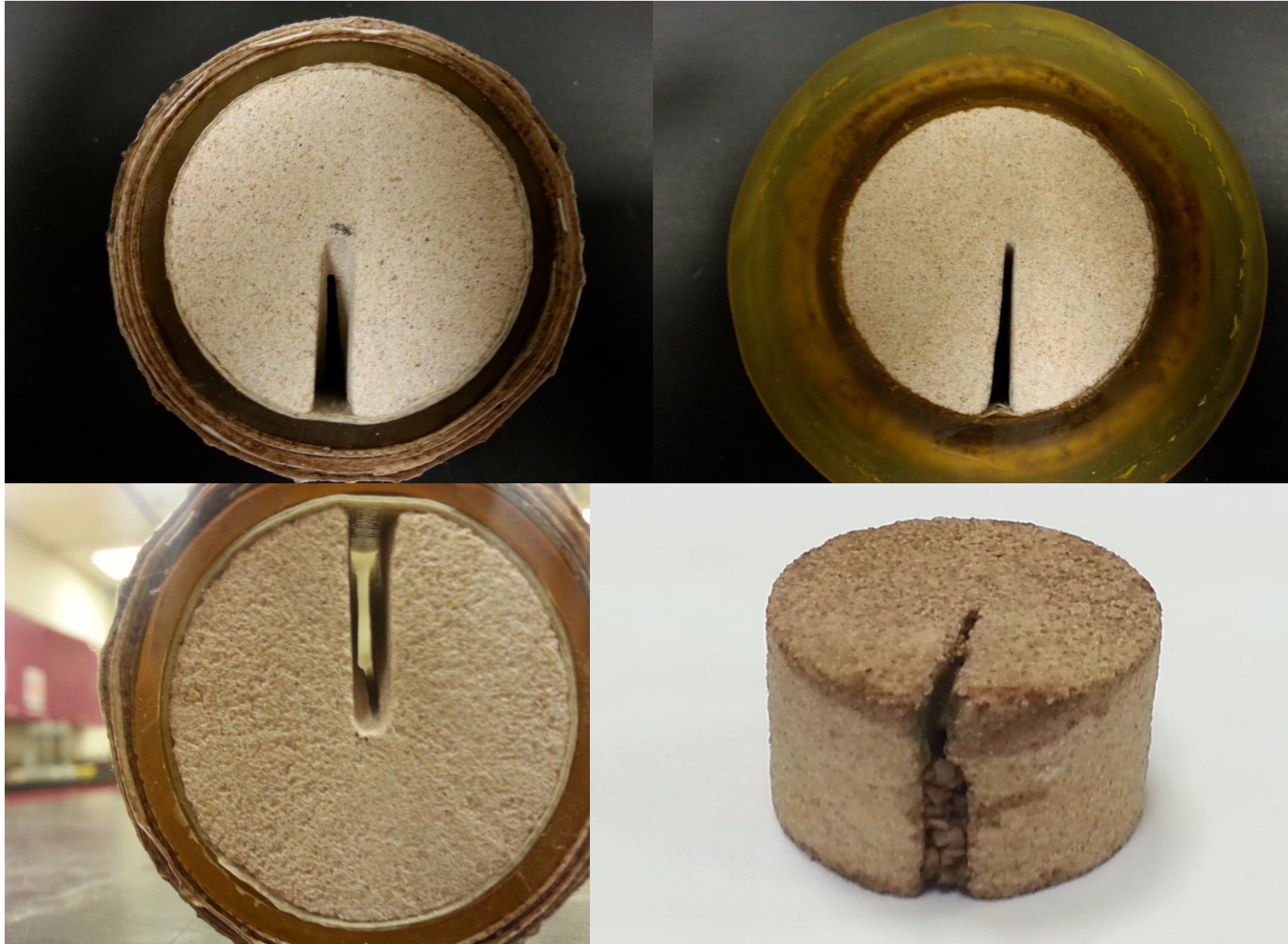
Cores with a Man-made Fracture Cores Fitted into HT-HP Sleeve