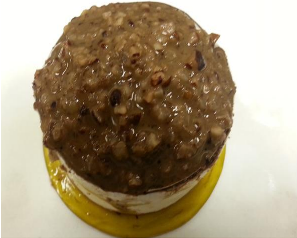
Using Crushed Palm Date Seeds