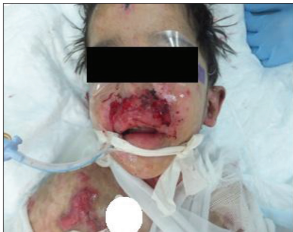
Figure 1: 5-year-old boy diagnosed case of dystrophic epidermolysis bullosa, immediately after induction of anesthesia