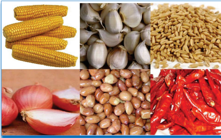
Figure 3. Some major sources of aflatoxins.