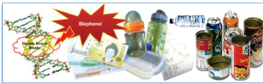
Figure 1. Some industrial applications of bisphenols.

Bisphenols are a group of chemicals known as diphenylmethanes, which contain two benzene rings separated by one central carbon atom, usually with a 4-OH substituent on both benzene rings (e.g., bisphenol A, bisphenol F, bisphenol AF, and bisphenol Z). Bisphenol A is employed to make certain plastics and epoxy resins ( Figure 1 ). In some bisphenols, the central carbon atom is replaced by a sulphone group (e.g., bisphenol S or bisphenol 1) or sulphide moiety (e.g., bisphenol 2). Some bisphenol A analogues seem to be safer alternatives to bisphenol A in industrial applications. For example, the production of bisphenol S, which is stable at high temperatures and resistant to sunlight, is increasing from year to year [7, 8]. The largest US manufacturer of thermal paper has been using bisphenol S as a replacement for bisphenol A since 2006. However, insufficient data are available to tell whether these bisphenol S-containing papers are safer than bisphenol A-containing papers. While bisphenol A is moderately susceptible to environmental breakdown, bisphenol S may be more persistent [9].