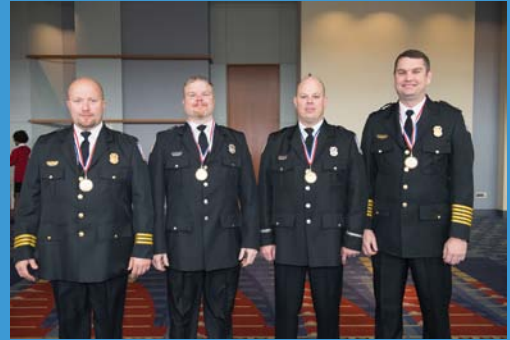
The 2014 Gold Medal Team, Cumberland County (N.C.) EMS