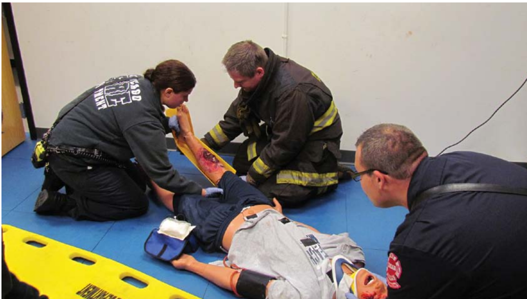
Firefighter and paramedics work together to assess and treat a simulated trauma victim.

The CFD STC has started preliminary data collection through the SafetyPAD EMS information management system to compare cardiac