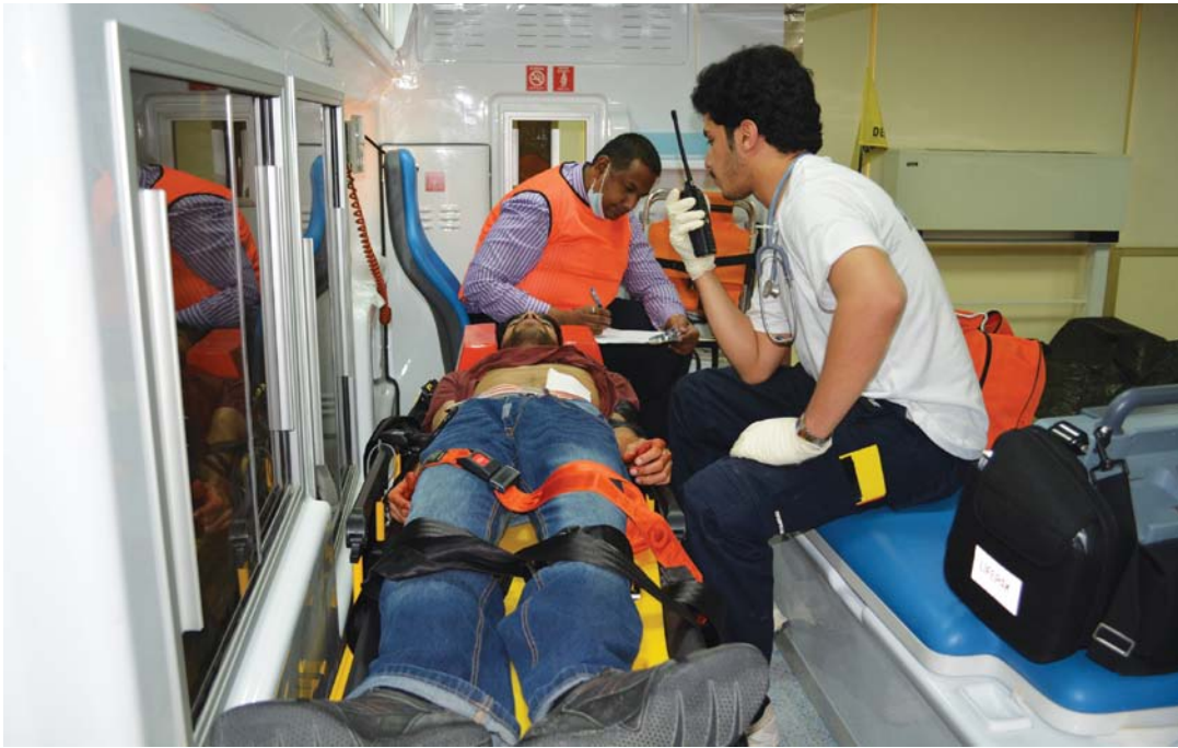
Ambulance simulators were designated as transporting ambulances.

ence, personal experience and recommendations for future MCI trainings.