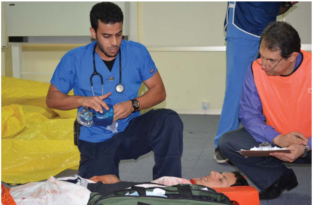
Each patient had an assigned evaluator who scored how each patient was triaged and treated.