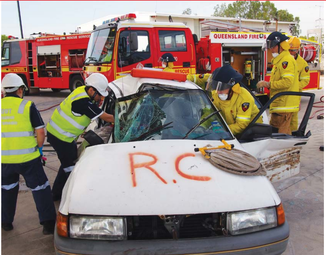
Firefighter and paramedics work together to assess and treat a simulated trauma victim.

dency to be tutor lead and constructed around a practical/ laboratory type session.