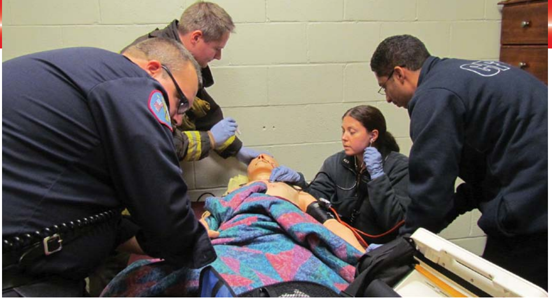
ALS fire and ALS ambulance crews work together to assess a patient—one of the Simulation Training Center's new high-fidelity manikins.

arrest runs prior to the ICCA course with runs handled after the launch of the class. This research focuses on comparing the amount of time CFD engine companies spend on scene, proper defibrillation technique (timing and number of shocks delivered), time spent off the chest of the patient, use of their Lifepak monitor/defibrillator and the patient's ultimate outcome. The data will be compiled and presented in a future paper.