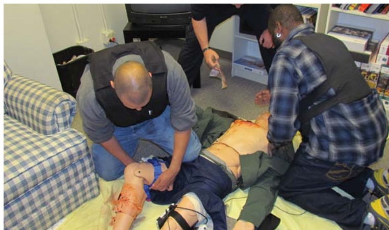
Law enforcement personnel apply a tourniquet to an injured simulated officer part of Law Enforcement Medical and Rescue Training.

They're also given the opportunity to go on ride alongs with CFD ambulance crews to get first-hand experience in the prehospital atmosphere and have the option to work on CFD STC research projects. This program provides a unique