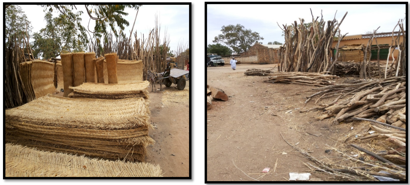
Plates 2. Local building materials trading at Dallanj town market

As shown in Table 7 a one-way analysis of variance (ANOVA) showed that respondent's occupations are significantly affect the uses of forests for the purposes of fuel wood, building materials, grazing, charcoal, trees products and entertainment (F= 8.400, 8.025, 5.180, 13.420, 2.790, 2.663 respectively, a = 0.05). These findings indicate that the respondents who work in occupations related to rural areas and natural resources (e.g. farmers, livestock breeders and wage laborers) are more widely use the forest's products. Table 8 also indicates that the respondent's occupations did not significantly affect the forest's uses for of hunting, furniture and beekeeping (F= 1.916, 1.449, 1.426 respectively, a = 0.05).