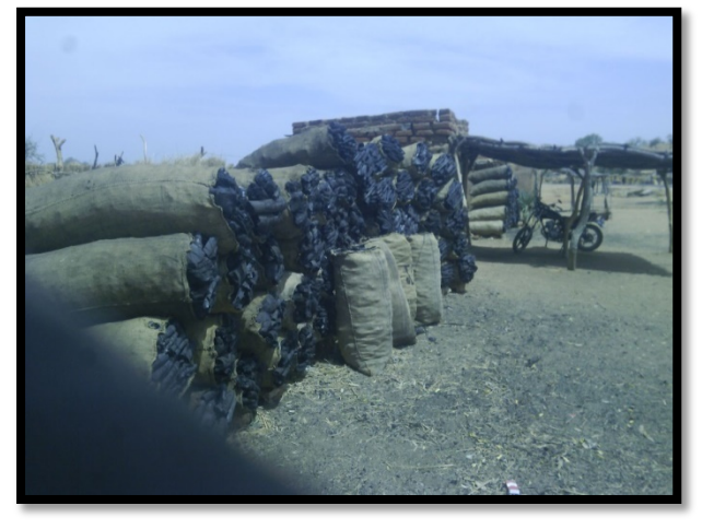
Charcoal sale points at ALsamaseem village, Kadugli - Khartoum tarmac road