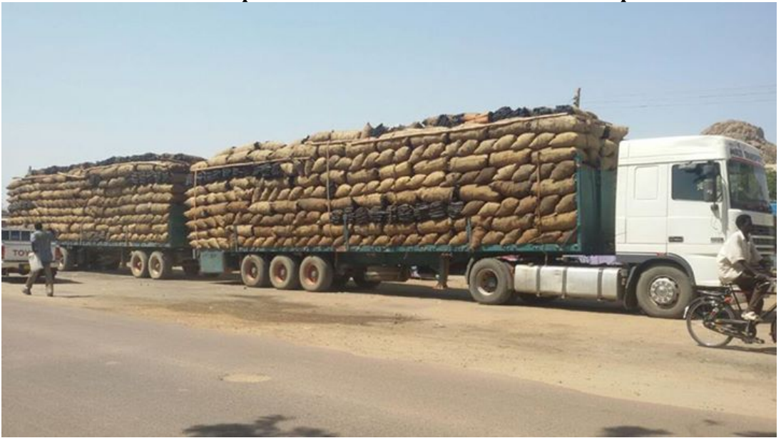
Plates 1. Charcoal Transportation of from Nuba Mountains to capital Khartoum

the sixth position with the mean 2.6 and SD 1.057. Some respondents especially from urban areas utilized the forest for recreation particularly in weekends, religious and social ceremonies.