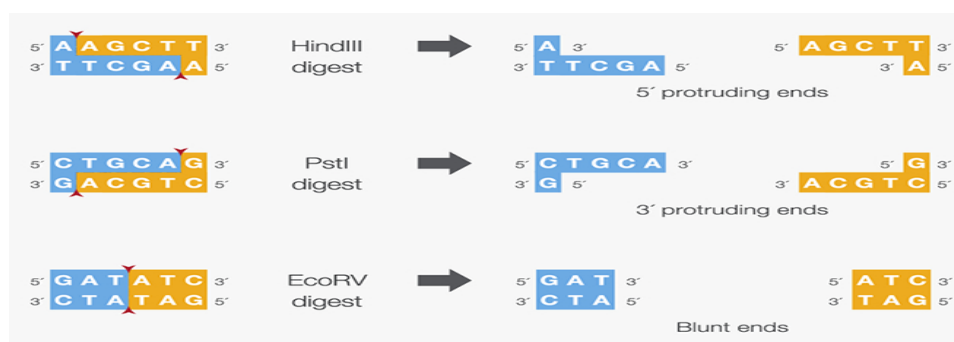
Figure.1. Generation of blunt and sticky ends fragments by different RE.