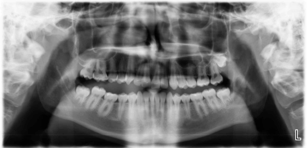
FIGURE 1: Panoramic radiograph

A 17-year-old male patient attended the oral and maxillofacial surgery clinic in King Saud University requesting extraction of all third molars. The patient's medical history was unremarkable; he was a non-smoker and revealed no history of previous facial trauma or surgery. There was neither pain nor swelling of the buccal and lingual sulci of the mandible and no cervical lymphadenopathy. Initial dental examination revealed a minimally restored permanent dentition with good oral hygiene. A panoramic radiograph showed that all third molars were present and impacted except on the upper right side where the tooth was missing, with the lower third molars in close proximity to the inferior alveolar canals (Figure 1). The radiograph was otherwise unremarkable with no signs of pathology or abnormality.