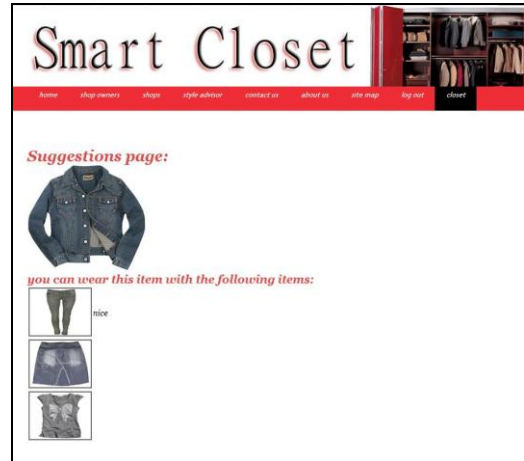
Figure 3. Example of a suggestion generated by the system

generated by the system. Fig. 4 shows how the mix and match facility looks like.