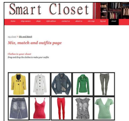
Figure 4. Mix and match page

The most important factors that we followed in suggestion process and how it was implemented are listed below: