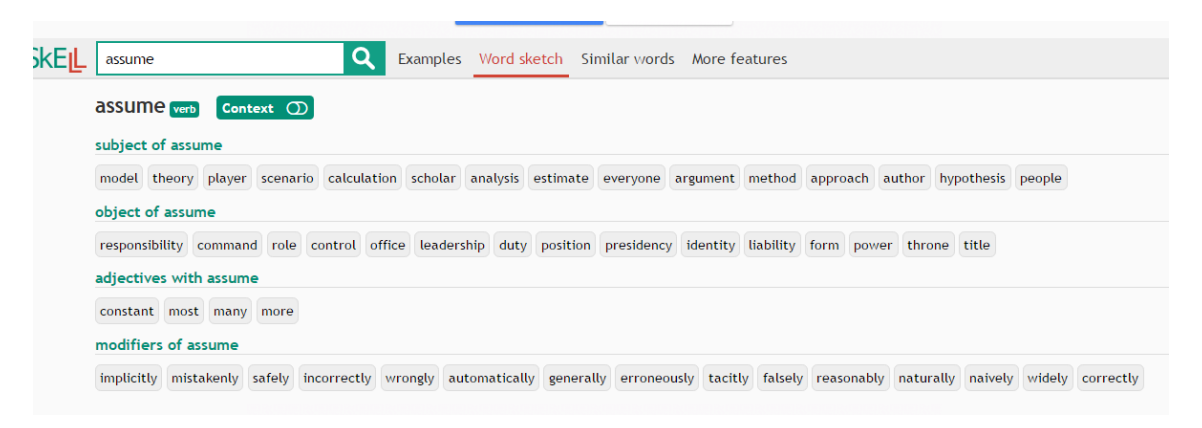
Figure 1 The word sketch of the verb assume as suggested by SkELL.