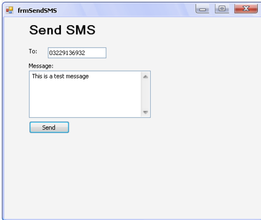
Figure 1: Send SMS

For sending SMS I have created a simple form frmSendSMS . The screenshot of the form is given in figure-1.