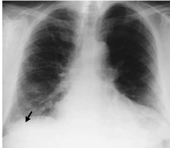
Figure 3. Chest Radiograph of a Patient with Idiopathic Pulmonary Fibrosis.

The typical chest radiograph in idiopathic pulmonary fibrosis reveals bilateral reticular opacities that are most prominent in the periphery of the lungs and in the lower lobes (Fig. 3). 39,42 Progressive fibrosis leads to cystic dilatation of the distal air spaces, which is visible as peripheral “honeycombing.” Decreased parenchymal compliance may lead to traction bronchiectasis, which is visible as thickened and dilated airways. Although virtually all patients will have an abnormal chest radiograph on presentation, unusual cases of biopsy-proved idiopathic pulmonary fibrosis have been reported with normal radiographic studies. 4