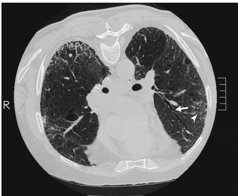
Figure 4. Chest CT Scan in a Patient with Idiopathic Pulmonary Fibrosis.

A representative high-resolution chest CT image from the patient whose radiograph is depicted in Figure 3 is shown. High-resolution CT images of the lung parenchyma are best obtained with the patient lying prone to reduce gravitational effects on lower-lobe lung density. There is prominent irregular septal thickening (arrowhead), subpleural honeycombing (asterisk), and a dilated airway, representing traction bronchiectasis (arrow). Open-lung biopsy confirmed pathological changes typical of usual interstitial pneumonia.