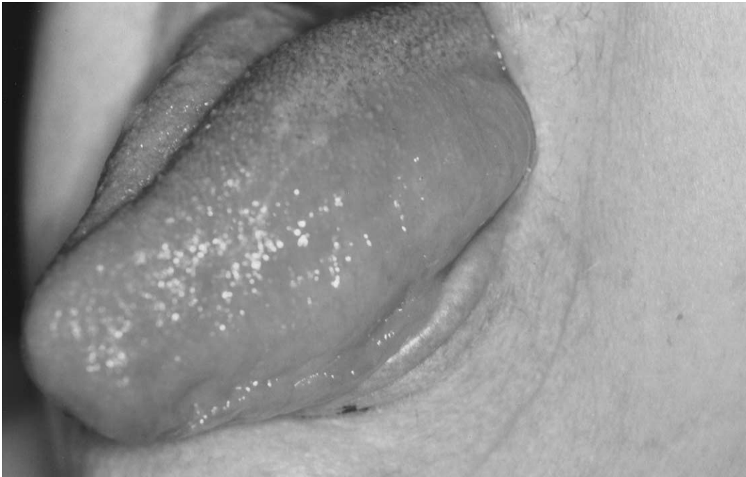
Fig 1. Angioedema of the left tongue and floor of mouth.

acquired loss of C1 esterase inhibitor due to a complement-mediated reaction; 3) ACE inhibitors; and 4) idiopathic.