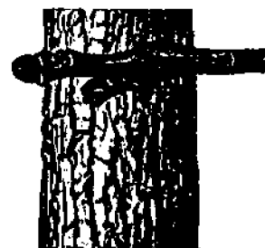
Figure 5. Shows the bark and a twig bud.