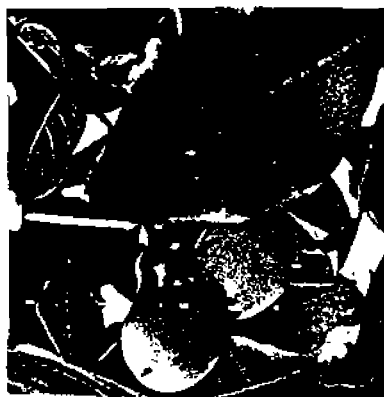
Figure 7. Shows immature Walnuts.