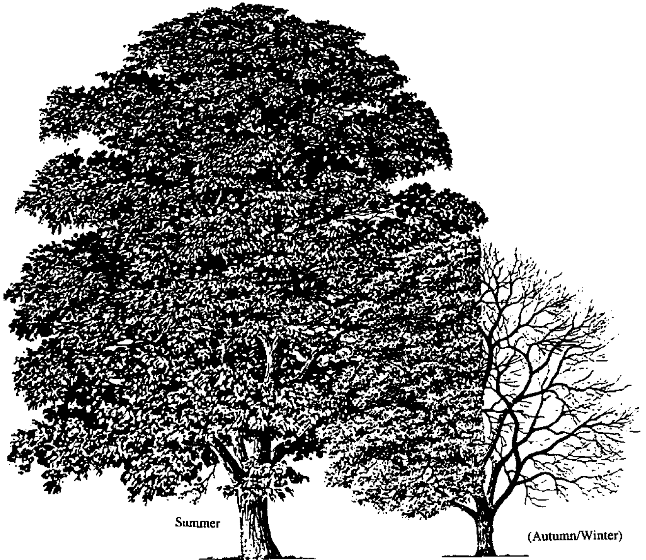
Figure 1. Shows the White Walnut tree ( Juglans regia ).