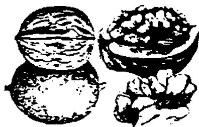
Figure 8. Shows nuts.