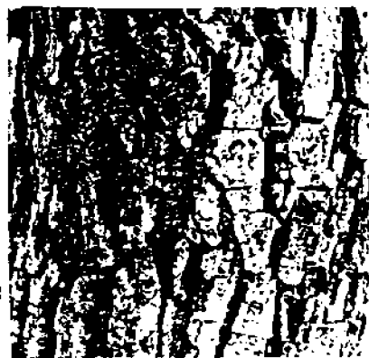
Figure 4. Shows the grey bark deeply fissured into a typical pattern of hard irregular ridges .

Walnut trees have a long life, some of them reach 300-400 years 34 . Its self pollinated, but uses two or more trees improves the yield. The tree takes five to eight years to bear nuts 14 .