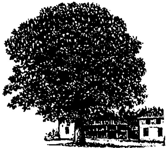
Figure 2. Shows the walnut tree.

The tree is called as a white walnut, common walnut, English walnut, or Persian walnut(Fig. 1,2), It belongs to the Juglandaceae and has the scientific name Juglans regia .