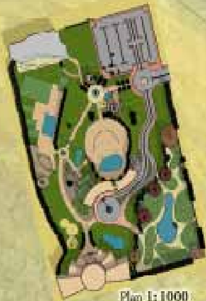
Plan 1: 1000