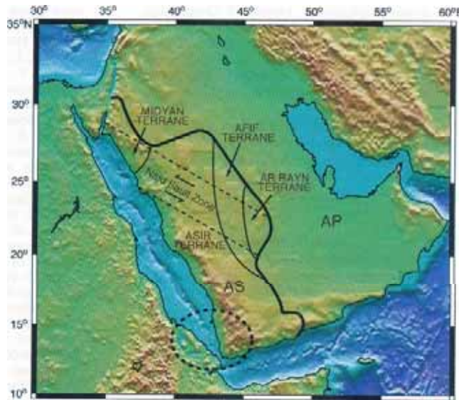
Figure 2. Topographic map with geologic boundaries. Boundary between Arabian Shield (AS) and Arabian Platform (AP) is marked by solid bold line, and approximate location of Afar upwelling is enclosed by dashed black circle. Thin dashed lines show trend of Najd fault zone, and thin solid lines show boundaries of major terranes, names of which are listed (modified from Stoesser and Camp, 1985).