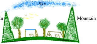
Figure 1: The flat earth

• The revelations of Holy Quran started with the following Ayats (verses) and continued for the next 23 years, until the entire Quran was revealed: