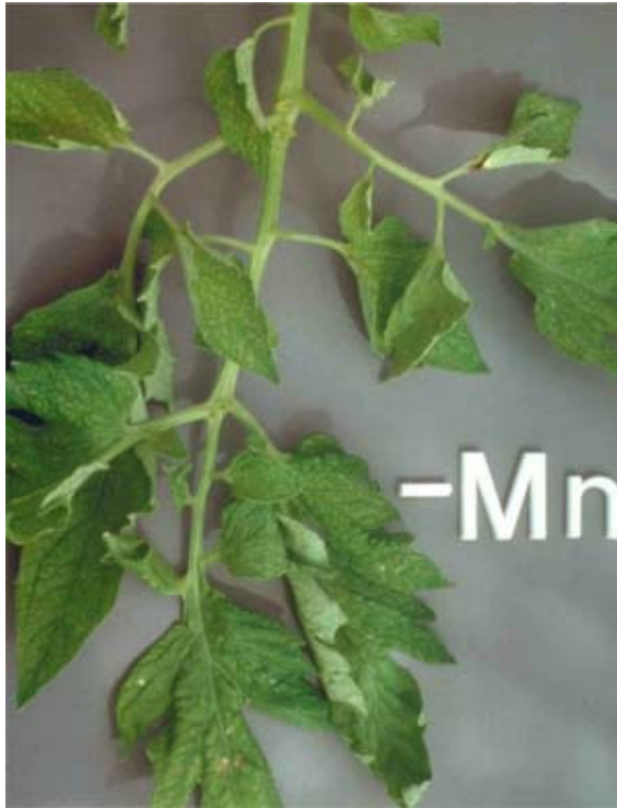
Web Figure 5.1.B Manganese deficiency symptoms in tomato. (Epstein and Bloom 2004)

chlorosis along with gray specks which elongate and coalesce, and eventually the entire leaf withers and dies.