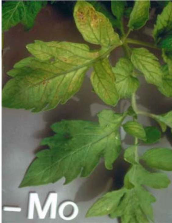
Web Figure 5.1.C Molybdenum deficiency symptoms in tomato. (Epstein and Bloom 2004)

Nitrogen. The chlorotic symptoms (see Figure 4) shown by this leaf resulted from nitrogen deficiency. A light red cast can also be seen on the veins and petioles. Under nitrogen deficiency, the older mature leaves gradually change from their normal characteristic green appearance to a much paler green. As the deficiency progresses these older leaves become uniformly yellow (chlorotic). Leaves approach a yellowish white color under extreme deficiency. The young leaves at the top of the plant maintain a green but paler color and tend to become smaller in size. Branching is reduced in nitrogen deficient plants resulting in short, spindly plants. The yellowing in nitrogen deficiency is uniform over the entire leaf including the veins. However in some instances, an interveinal necrosis replaces the chlorosis commonly found in many plants. In some plants the underside of the leaves and/or the petioles and midribs develop traces of a reddish or purple color. In some plants this coloration can be quite bright. As the deficiency progresses, the older leaves also show more of a tendency to wilt under mild water stress and become senescent much earlier than usual. Recovery of deficient plants to applied nitrogen is immediate (days) and spectacular.