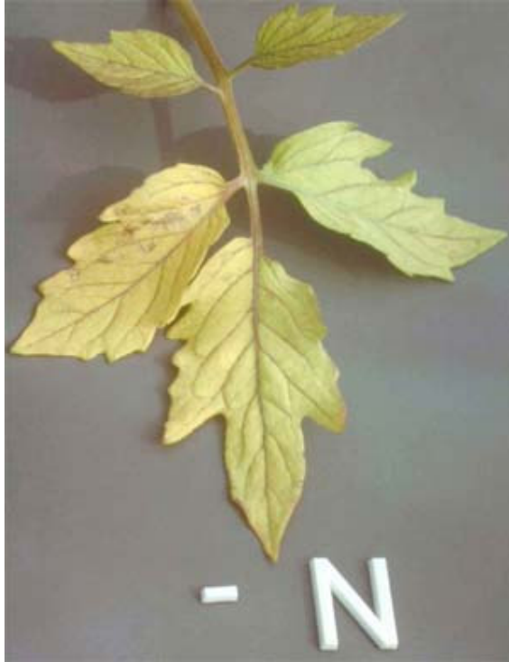
Web Figure 5.1.D Nitrogen deficiency symptoms in tomato. (Epstein and Bloom 2004)

Phosphorus. These phosphorus-deficient leaves (see Figure 5) show some necrotic spots. As a rule, phosphorus deficiency symptoms are not very distinct and thus difficult to identify. A major visual symptom is that the plants are dwarfed or stunted. Phosphorus deficient plants develop very slowly in relation to other plants growing under similar environmental conditions but without phosphorus deficiency. Phosphorus deficient plants are often mistaken for unstressed but much younger plants. Some species such as tomato, lettuce, corn and the brassicas develop a distinct purpling of the stem, petiole and the under sides of the leaves. Under severe deficiency conditions there is also a tendency for leaves to develop a blue-gray luster. In older leaves under very severe deficiency conditions a brown netted veining of the leaves may develop.