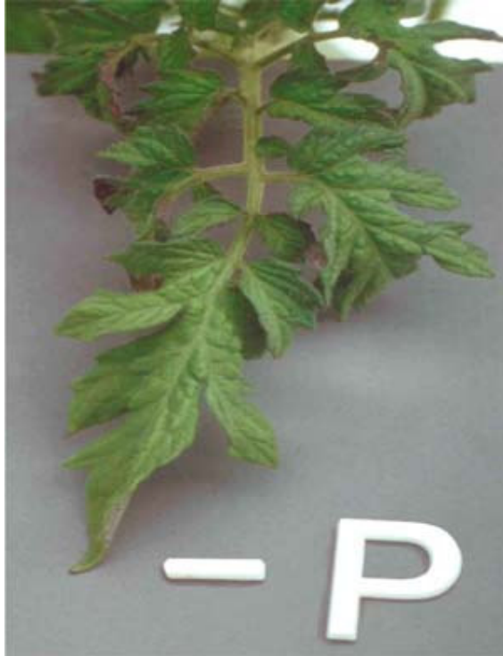
Web Figure 5.1.E Phosphorus deficiency symptoms in tomato. (Epstein and Bloom 2004)

Sulfur. This leaf (see Figure 6) shows a general overall chlorosis while still retaining some green color. The veins and petioles show a very distinct reddish color. The visual symptoms of sulfur deficiency are very similar to the chlorosis found in nitrogen deficiency. However, in sulfur deficiency the yellowing is much more uniform over the entire plant including young leaves. The reddish color often found on the underside of the leaves and the petioles has a more pinkish tone and is much less vivid than that found in nitrogen deficiency. With advanced sulfur deficiency brown lesions and/or necrotic spots often develop along the petiole, and the leaves tend to become more erect and often twisted and brittle.