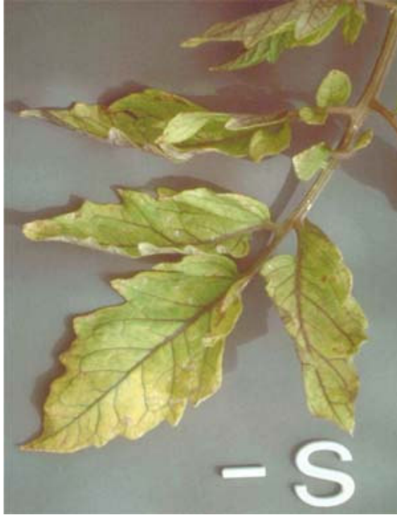
Web Figure 5.1.F Sulfur deficiency symptoms in tomato. (Epstein and Bloom 2004)

Zinc. This leaf (see Figure 7) shows an advanced case of interveinal necrosis. In the early stages of zinc deficiency the younger leaves become yellow and pitting develops in the interveinal upper surfaces of the mature leaves. Guttation (see textbook Figure 4.5) is also prevalent. As the deficiency progresses these symptoms develop into an intense interveinal necrosis but the main veins remain green, as in the symptoms of recovering iron deficiency. In many plants, especially trees, the leaves become very small and the internodes shorten, producing a rosette like appearance.