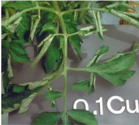
Web Figure 5.1.K Copper deficiency symptoms in tomato. (Epstein and Bloom 2004)

Copper. These copper-deficient leaves (see Figure 11) are curled, and their petioles bend downward. Copper deficiency may be expressed as a light overall chlorosis along with the permanent loss of turgor in the young leaves. Recently matured leaves show netted, green veining with areas bleaching to a whitish gray. Some leaves develop sunken necrotic spots and have a tendency to bend downward. Trees under chronic copper deficiency develop a rosette form of growth. Leaves are small and chlorotic with spotty necrosis.