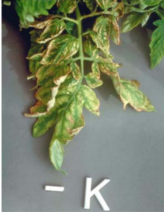
Web Figure 5.1.M Potassium deficiency symptoms in tomato. (Epstein and Bloom 2004)

The onset of potassium deficiency is generally characterized by a marginal chlorosis progressing into a dry leathery tan scorch on recently matured leaves. This is followed by increasing interveinal scorching and/or necrosis progressing from the leaf edge to the midrib as the stress increases. As the deficiency progresses, most of the interveinal area becomes necrotic, the veins remain green and the leaves tend to curl and crinkle. In some plant such as legumes and potato, the initial symptom of deficiency is white speckling or freckling of the leaf blades. In contrast to nitrogen deficiency, chlorosis is irreversible in potassium deficiency, even if potassium is given to the plants. Because potassium is very mobile within the plant, symptoms only develop on young leaves in the case of extreme deficiency. Potassium deficiency can be greatly alleviated in the presence of sodium but the resulting sodium-rich plants are much more succulent than a high potassium plant. In some plants over 90% of the required potassium can be replaced with sodium without any reduction in growth.