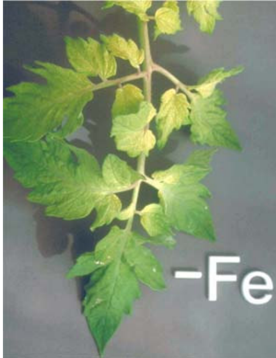
Figure 5.1.L Iron deficiency symptoms in tomato. (Epstein and Bloom 2004)

Potassium. Some of these leaves (see Figure 13) show marginal necrosis (tip burn), others at a more advanced deficiency status show necrosis in the interveinal spaces between the main veins along with interveinal chlorosis. This group of symptoms is very characteristic of K deficiency symptoms.