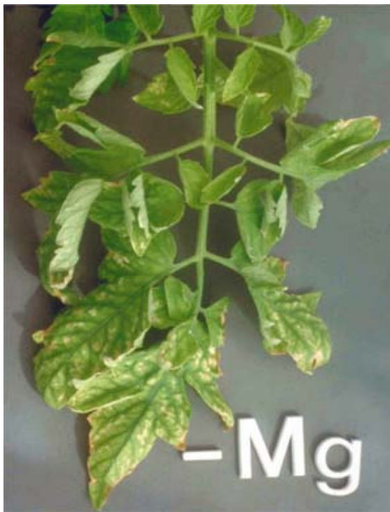
Web Figure 5.1.A Magnesium deficiency symptoms in tomato. (Epstein and Bloom 2004)

Magnesium. The Mg-deficient leaves (see Web Figure 5.1.A) show advanced interveinal chlorosis, with necrosis developing in the highly chlorotic tissue. In its advanced form, magnesium deficiency may superficially resemble potassium deficiency. In the case of magnesium deficiency the symptoms generally start with mottled chlorotic areas developing in the interveinal tissue. The interveinal laminae tissue tends to expand proportionately more than the other leaf tissues, producing a raised puckered surface, with the top of the puckers progressively going from chlorotic to necrotic tissue. In some plants such as the Brassica (The mustard family, which includes vegetables such as broccoli, brussel sprouts, cabbage, cauliflower, collards, kale, kohlrabi, mustard, rape, rutabaga and turnip.), tints of orange, yellow, and purple may also develop.