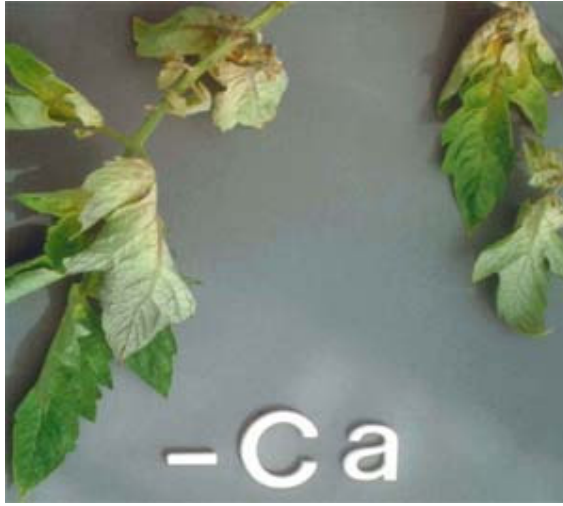
Web Figure 5.2.I Calcium deficiency symptoms in tomato. (Epstein and Bloom 2004)

calcium deficiency have a much greater tendency to wilt than non-stressed plants.