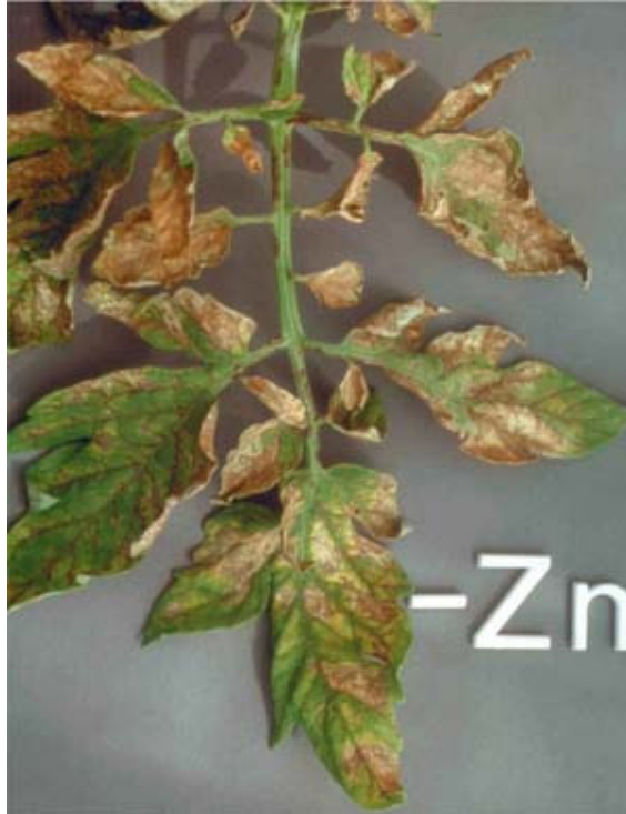
Web Figure 5.1.G Zinc deficiency symptoms in tomato. (Epstein and Bloom 2004)

Boron. These boron-deficient leaves (see Figure 8) show a light general chlorosis. The tolerance of plants to boron varies greatly, to the extent that the boron concentrations necessary for the growth of plants having a high boron requirement may be toxic to plants sensitive to boron. Boron is poorly transported in the phloem of most plants, with the exception of those plants that utilize complex sugars, such as sorbitol, as transport metabolites. In a recent study, (see Brown et al., 1999) tobacco plants engineered to synthesize sorbitol were shown to have increased boron mobility, and to better tolerate boron deficiency in the soil.