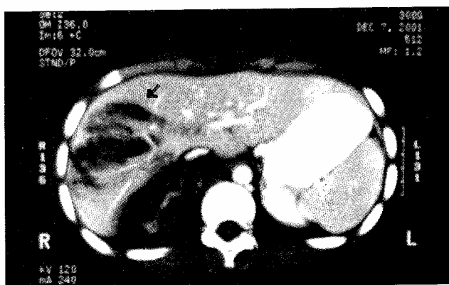
Figure 1 - Computed tomogram of the abdomen showing a radiating laceration of the right hepatic lobe grade IV (Bear Claw type).