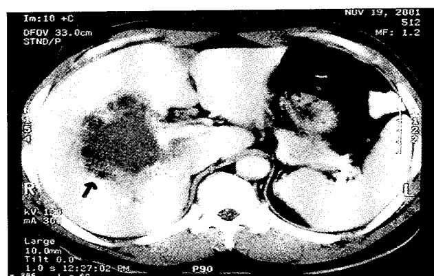
Figure 4 - Follow up computed tomogram of the abdomen after one week showing an unorganized intra-hepatic hematoma (clinically presented as secondary infection of the hematoma).

classified as grade I in 11 patients (31%), grade II in 13 patients (37%), grade III in 7 patients (20%), grade IV in 4 patients (11.4%) Figures 1, 2 & 3 . There was no grade V injury, and no case of "pooling of contrast" or extravasation. The associated intraabdominal injuries shown on CT were retroperitoneal hematoma in 4 patients, splenic tear in 3 patients and mesenteric hematoma in 2 patients. The associated extra-abdominal injuries were ribs fracture in and pneumothorax in 10 patients, head injuries in 7 patients, injuries to extremities in 6 patients, pelvic fracture in 5 patients and maxillofacial trauma in 5 patients. The majority of the patients (77%) were admitted to ICU for continuous monitoring. Blood transfusion was given to 8 patients (23%) with mean rate of 2.1 units per patient (range 1-4). The nonoperative treatment succeeded in all patients except one who became hemodynamically unstable during observation. He underwent laparotomy and control of active