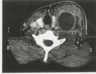
Figure 2 - Computed tomography scan of the neck showing cyst cavity (CC). Left thyroid lobe (LT) compressed medially and carotid sheath (CS) anteromedially. The typical position of third branchial cyst. SM - sternomastoid muscle.