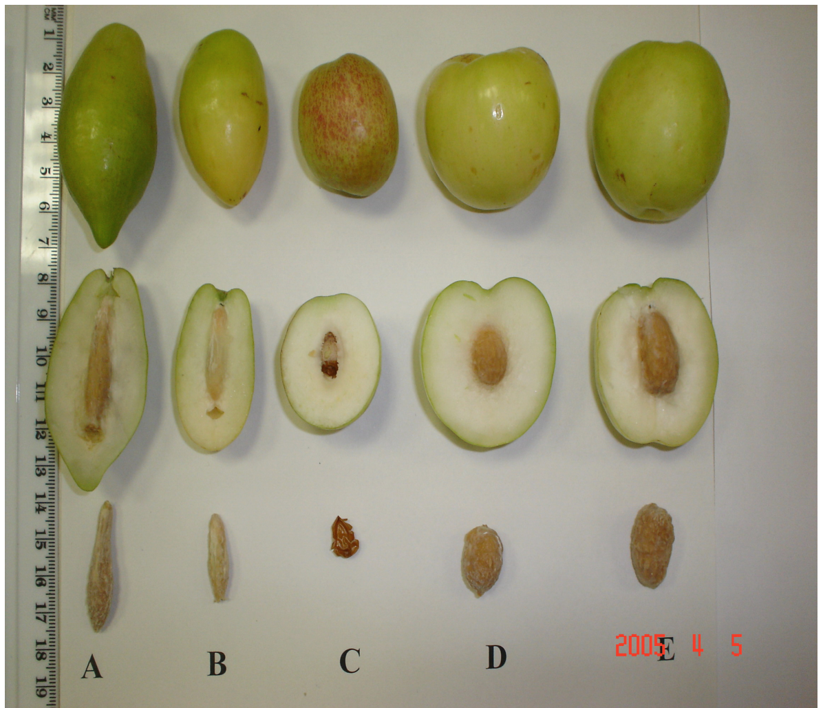
Figure (1): Fruit morphology of the five ber cultivars; A= Komethry, B= Pakstany, C= Um- sulaem, D= Toffahy and E=Peyuan