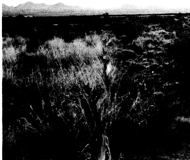
Fig. 1. Photographs across the fences surrounding plots from which kangaroo rats were removed (left side of fence). (Top) Increase of the yellow-flowered, large-seeded annual, Lesquerella gordonii , 5 years after kangaroo rat removal. (Bottom) Increase in tall-statured annual and perennial grasses 13 years after kangaroo removal.